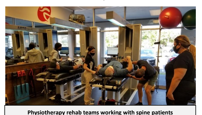
Yet the back pain merry go round of physiotherapy, pain clinics, counselling, consideration for injections and surgery can drain time and take up valuable resource.

There are of course many forms and causes of back and neck pain and much as we might like one, there is no single silver bullet or elixir to deal with every condition.