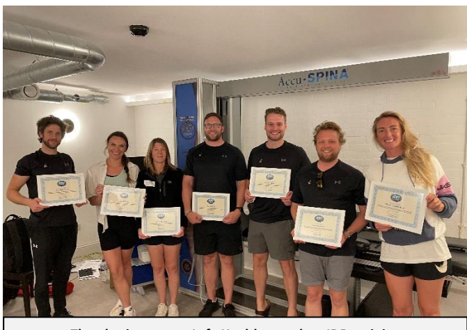
The physio team at Lyfe Health complete IDD training

Summer 2023 saw Lyfe Health take over a former branch of NatWest bank in Bournemouth. Part of The Medical Healthcare Centres and already providing IDD Therapy in Bristol, the project in Bournemouth is impressive.