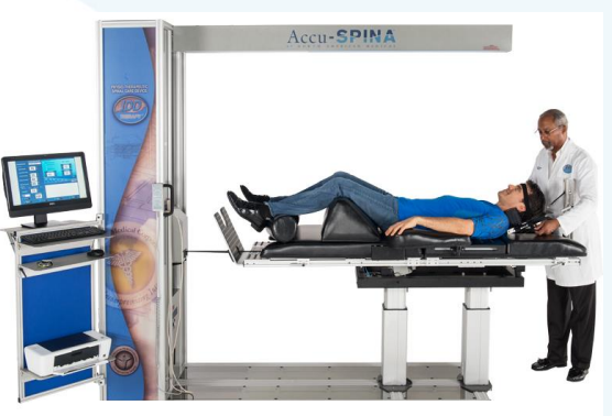
IDD Therapy for Neck Pain

Additionally, after receiving IDD Therapy, concentrate on maintaining good posture. This will help keep your spine properly aligned and may further reduce your pain. You will be given guidance on gentle exercises to follow and the closer you stick with the guidance you are given, the better your chance of long term pain relief.