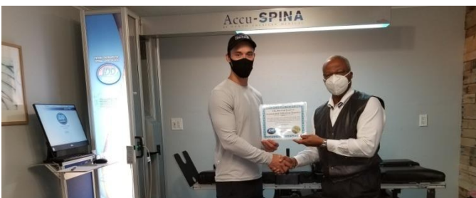
* Clinician Referral Form: iddtherapy.co.uk/referral *

Combined with manual therapy and exercise, a programme of IDD Therapy can help disc patients get out of pain and moving again, with goals to avoid long term medication use, injections and ultimately to avoid the need for spinal surgery. #changingspinecare