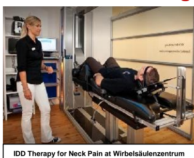
IDD Therapy for Neck Pain at Wirbelsäulenzentrum

With three main clinics in the central state of Hesse in Germany, Wirbelsäulenzentrum is a leading neurosurgery group helping patients with spinal disorders and back pain. As might be expected, the clinics provide a spectrum of treatments, from complex spinal surgery to physiotherapy and rehabilitation programmes, including IDD Therapy at two of the clinics.