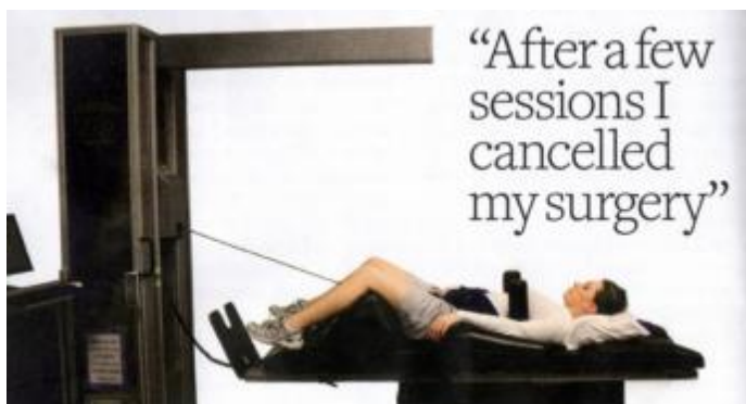
IDD Therapy making the headlines – Readers Digest

What we don’t usually appreciate with the overnight stars is the hours of practice and hard work that goes in for years to be able to perform and succeed on the day of emergence.