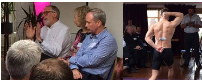
Expert panel discussion with clinical Q&A plus a demo of advanced movement assessment with ViMove sensors

This year's conference heard animated discussions on treating complex disc conditions, the success of cervical spine (neck) treatment and a look at outcomes with a variety of conditions ranging from spinal stenosis to spinal cysts.