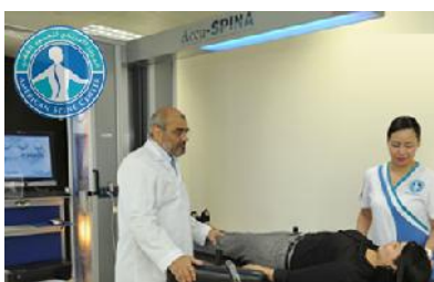
The American Spine Centre, Dubai

IDD Therapy is established in many countries around the world. The United Arab Emirates is well known for its excellence in healthcare and a leading example of this is the multi-disciplinary American Spine Center (ASC) in Dubai. The ASC is also in the USA.