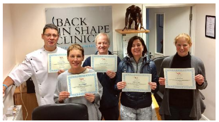
The Back In Shape team are delighted to introduce IDD Therapy

Croydon-based physiotherapists, Back in Shape are one of the latest clinics to join the Disc Clinic network.