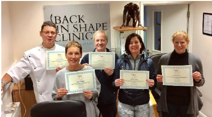
The Back In Shape team are delighted to introduce IDD Therapy

Croydon-based physiotherapists, Back in Shape are one of the latest clinics to join the Disc Clinic network.