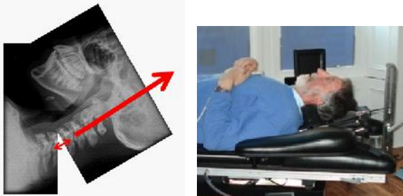
Fig 2 – By gently gripping the base of the skull, the distraction force is focused to different cervical (neck) levels to relieve pressure on discs

Physiotherapist Mark Webb is clinical director of Broad Oaks Health Clinic in Solihull. Mark says “As IDD Therapy expands, I am seeing growing numbers of patients with unresolved disc problems in the cervical spine. IDD Therapy enhances what we as physiotherapists can do for neck pain patients in a precise, controlled and safe manner.”